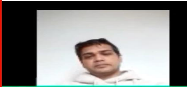
Director Institute of Health Sciences Bhubaneswar